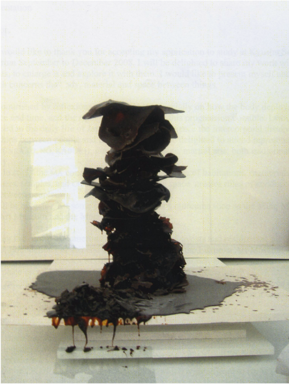
Orange Blue , video-installation, 2008